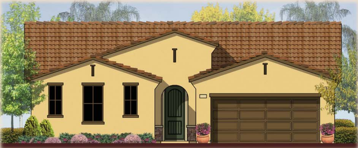
Elevation A Tuscan