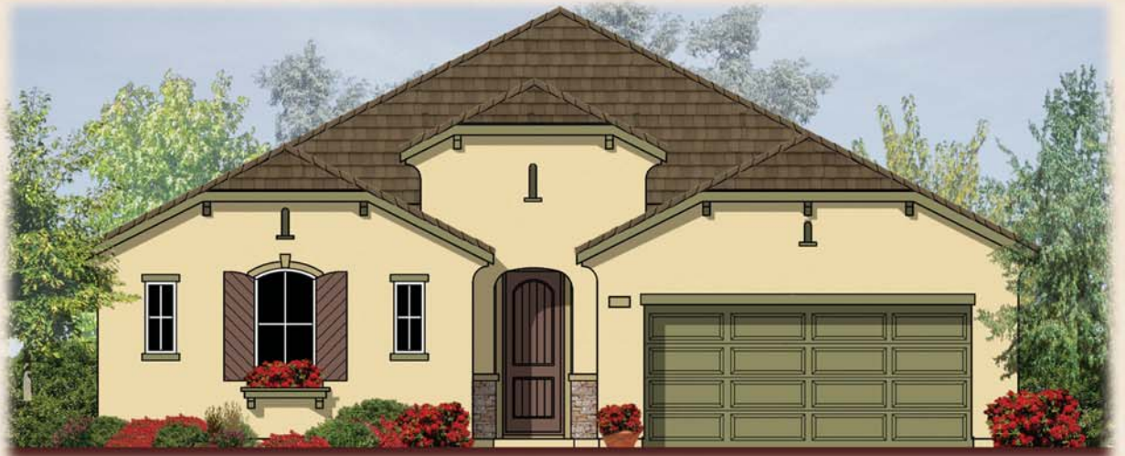
Elevation B French