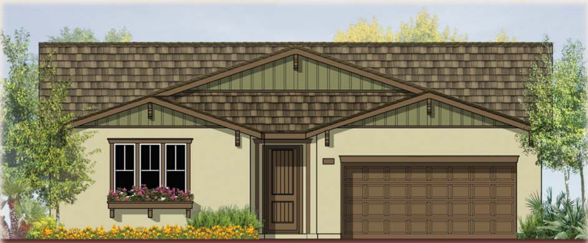
Elevation C Ranch